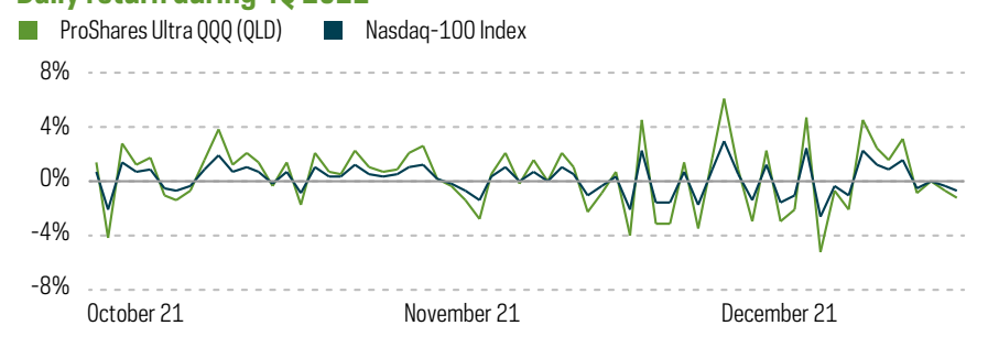
Daily return during 40 2021

The scatter graph charts the daily NAV-to-NAV results of the fund against its underlying index return on a daily basis.